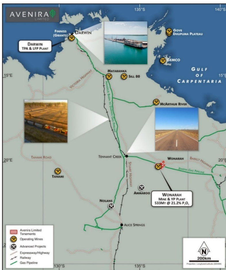
Figure 1: Location map of Wonarah