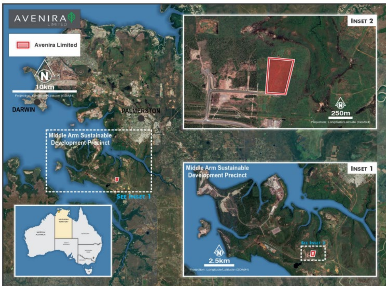
Figure 2: Location of Land in the Middle Arm Sustainable Development Precinct for Avenira's LFP Project