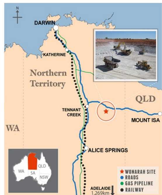
FIGURE 1: WONARAH PROJECT LOCATION MAP